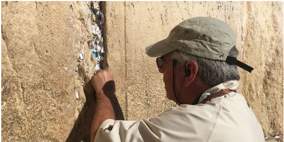
Placing a prayer at the Western Wall, Old Jerusalem, Israel

If I have told you earthly things, and you believe not, how shall you believe, if I tell you of heavenly things?(John 3:12)