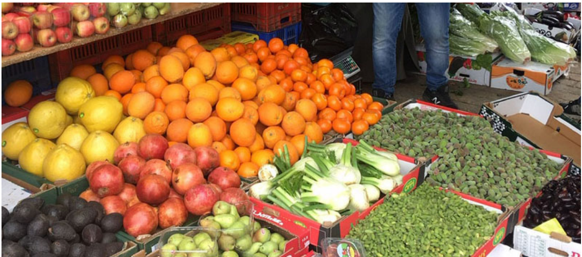
Produce market, Old Jerusalem, Israel

My father came to our family's promise land, America, with his mother and two brothers in the fall of 1920. As they left Naples, Italy he thought about seeing his father and two older brothers who sent them money for passage, via ship, to America after a long separation because of WWI.