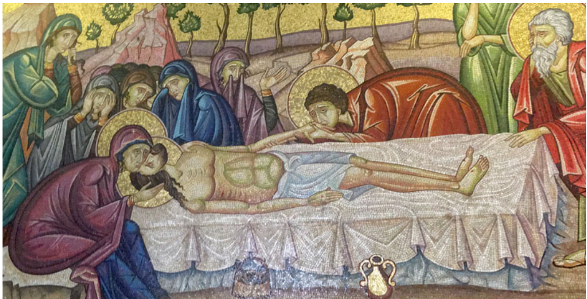
Mosaic of the burial of Jesus, Church of the Holy Sepulcher, Old Jerusalem

As a sidebar, the Shroud of Turin is the first example of negative photography in the world. Watch YouTube's "The Shroud of Turin, the Face of Jesus" documentary, it will make you a believer. (The Shroud of Turin, the Face of Jesus" documentary, History Channel)