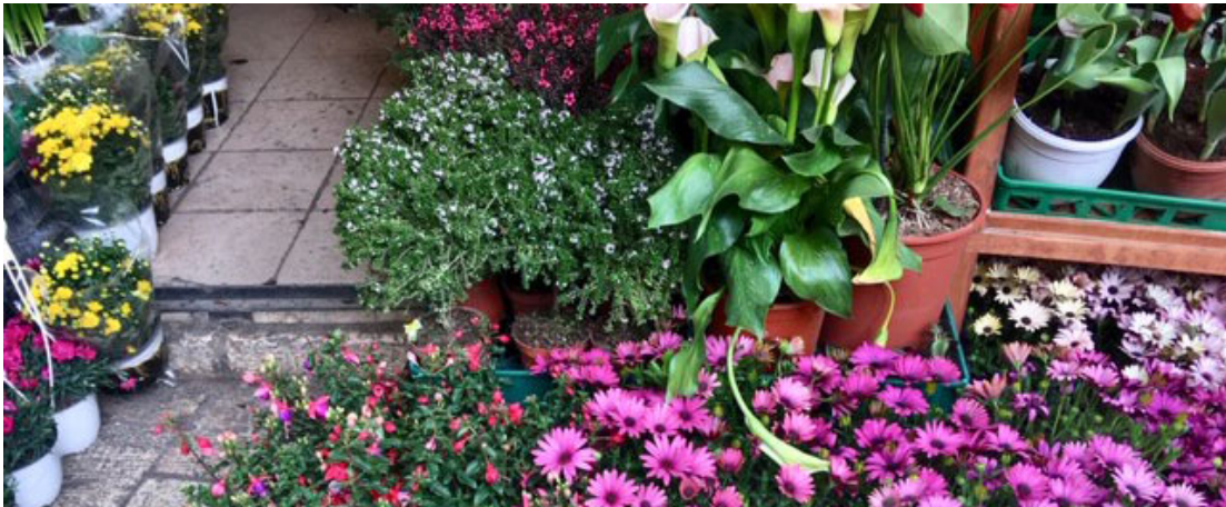
Flower market, Old Jerusalem, Israel

And the Lord God planted a garden eastward in Eden; and there he put the man whom he had formed. And out of the ground made the Lord God to grow every tree that is pleasant to the sight, and good for food; the tree of life also in the midst of the garden, and the tree of knowledge of good and evil.