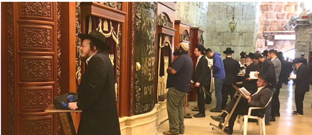
Jews pray in tunnel, which is part of the Western Wall, Old Jerusalem

Recent archaeological excavations suggest that the actual route maybe located near the Tower of David and many feet below the present walkway, which was built over for the better part of 2,000 years. (The Underground Street of Via Dolorosa, Sergio and Rhoda)