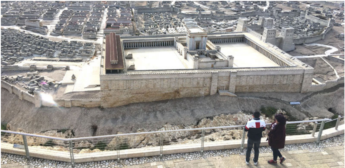
Holy Land Model, Jerusalem, Israel

In the Bible, only three people are mentioned seeing a rainbow: Noah, after God placed a rainbow in the sky as a reminder of His covenant, and the apostle John and prophet Ezekiel, in a vision, witnessed a rainbow over the throne of God (Revelation 4:3). The rainbow colors red, purple, scarlet and crimson were used throughout Moses' tabernacle in the wilderness.