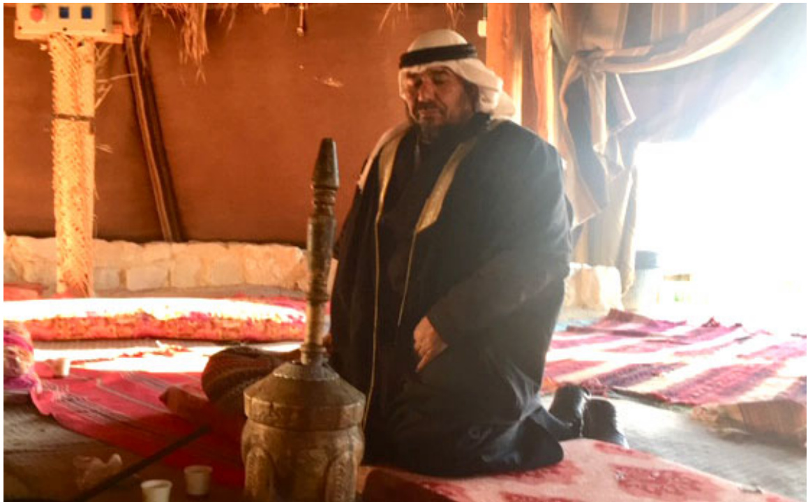
Bedouin about to grind roasted coffee beans, Southern District Israel