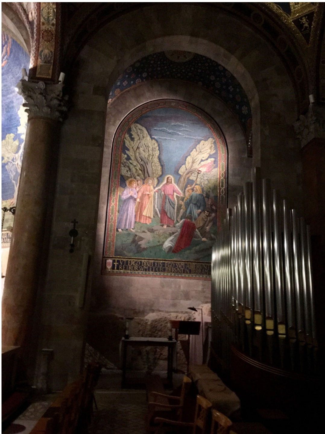
Judas betrays Jesus. Basilica of the Agony, Garden of Gethsemane, Israel