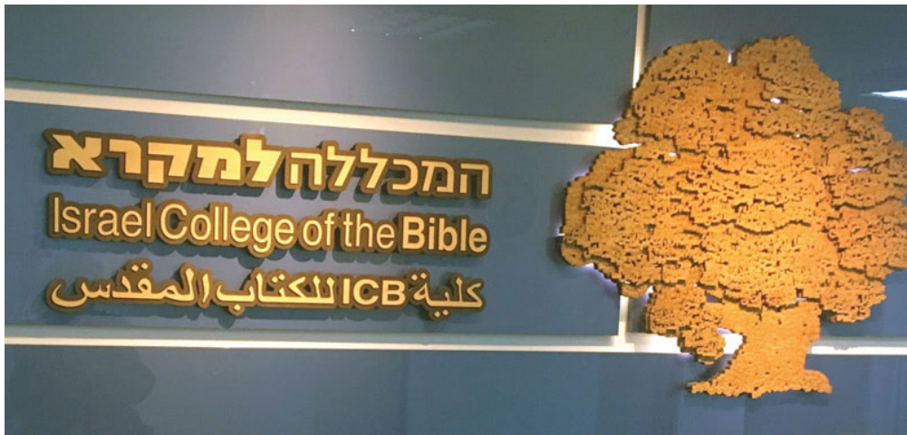
Israel College of the Bible logo and signage, Israel

Then I will give you rain in due season, and the land shall yield her increase, and the trees of the field shall yield their fruit. (Leviticus 26:4.) These trees are feminine.