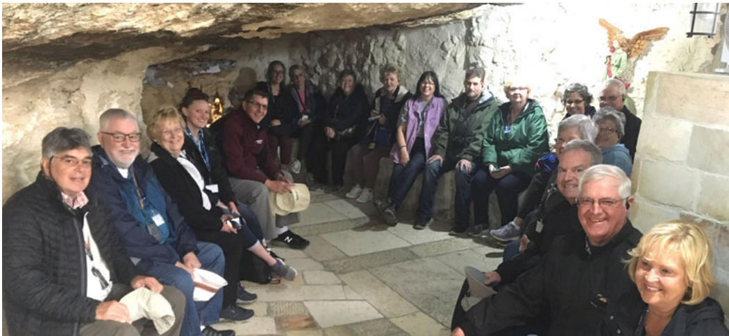
My Israeli tour group, not King Solomon's children, Israel

King Solomon had a harem of over 1,000 wives, princesses and concubines. The Bible lists only three offspring. God warned Solomon that because some of his wives worshiped heathen gods and they eventually will turn his heart from the Lord. The Lord was right and was angered when an aging Solomon built sacrifice alters to others gods. (1 Kings 11)