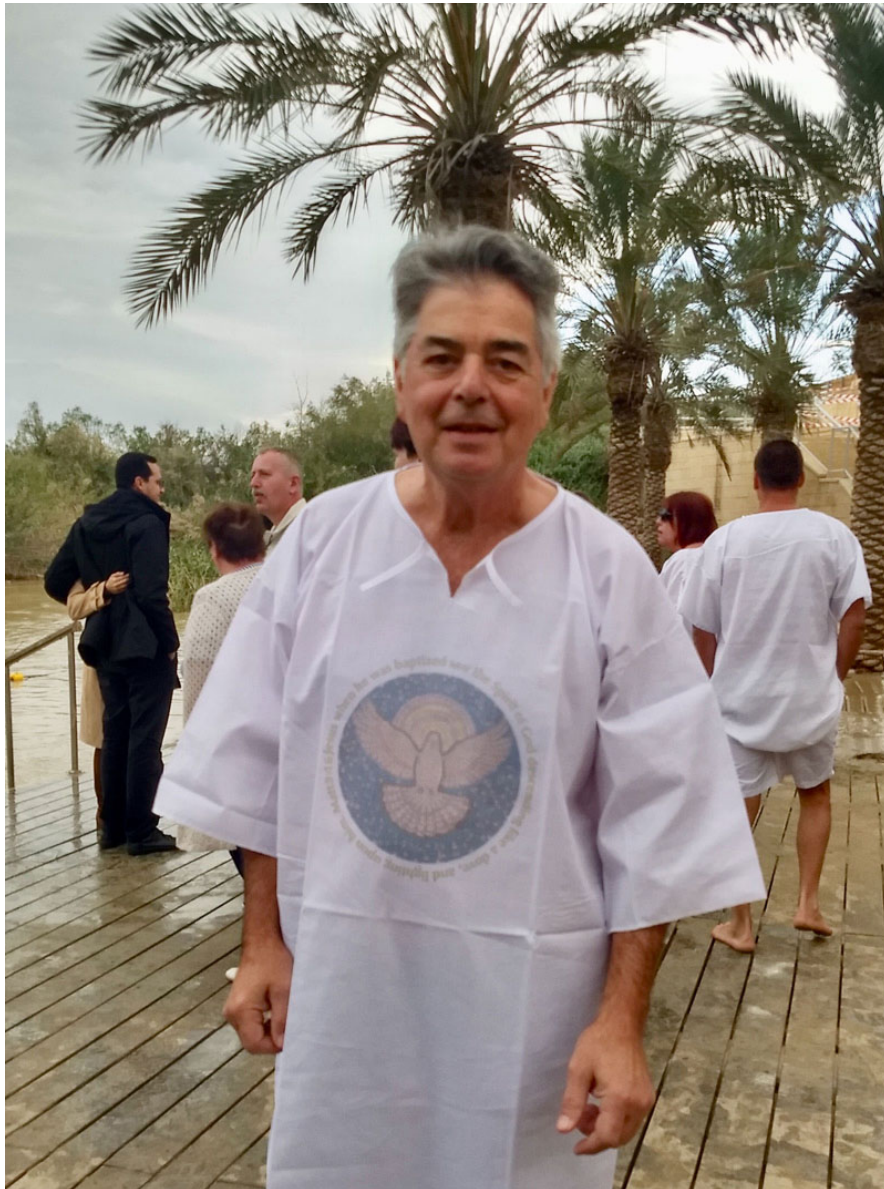
2019 Baptism in the Jordan River, Israel

Ohio. I obviously don't remember my first time but the last two were very special to me. I've been blessed and feel honored that this off and on again follower of Jesus intends to stay on the straight and narrow until judgment day. My Jordan River baptism was a recommitment pledge of love.