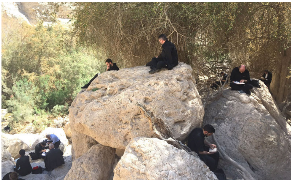
Priests studying the Bible, Southern District, Israel

Romans 11:10-23, Paul says that due to the Jews that have stumbled, the Gentiles were allowed to be grafted into the tree of salvation. But remember, the Jews are holy branches growing out of the holy tree and grounded by holy roots. If they repent they will be re-grafted. He that sins is but a branch to be pruned whether Jew or Gentile.