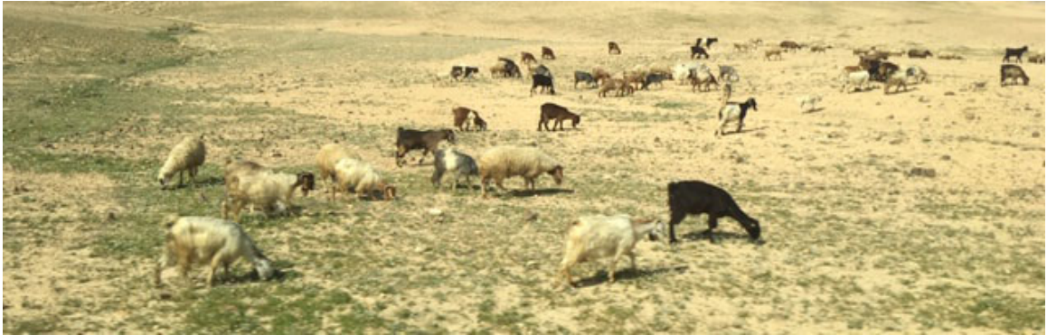
A herd of goats grazing along desert valley road, Southern District, Israel

established towns, cities and countries you'd think they would have treated one another as distant relatives throughout the known world. I'm surprised it's not mentioned more in the Bible, other than in Genesis.