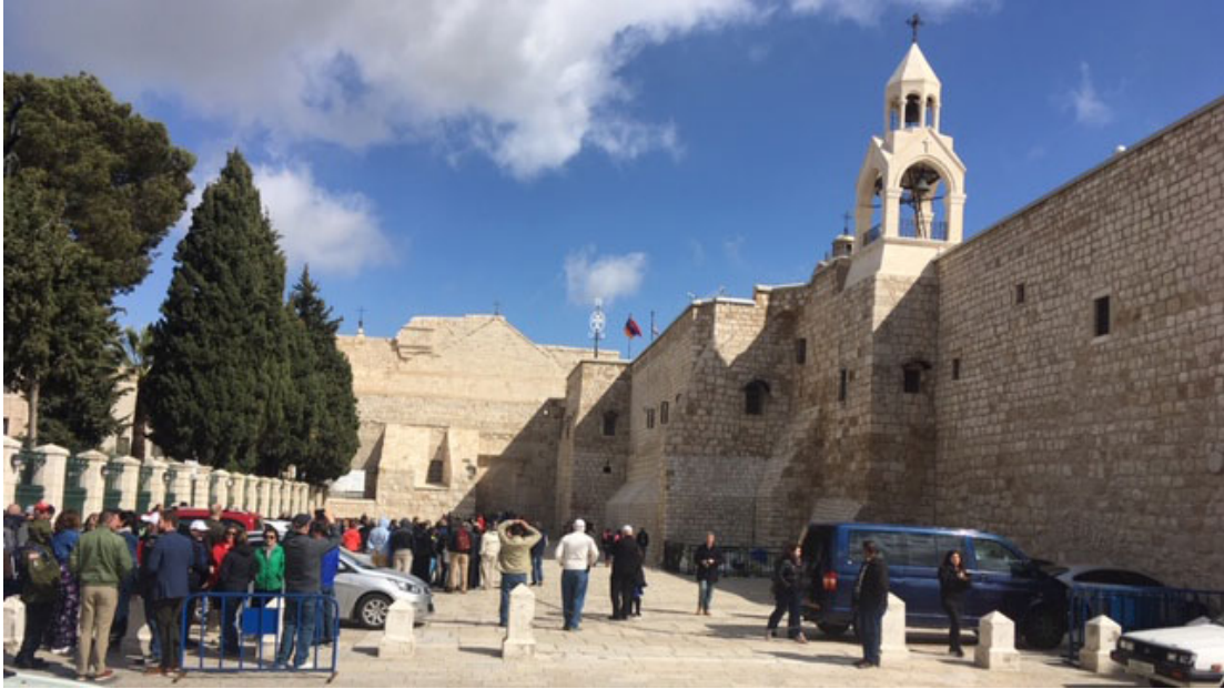
The Church of the Nativity, Bethlehem, Israel

Therefore thus says the Lord God, Behold, I lay in Zion for a foundation a stone, a tried stone, a precious corner stone, a sure foundation [...] (Isaiah 28:16)