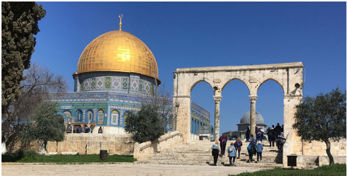
The Temple Mount, Old Jerusalem, Israel

The Temple Mount has been a holy site for thousands of years and is historically significant for the major Abrahamic religions: Judaism, Christianity and Islam. It is considered one of the three holiest sites in Islam and is revered as the location of Muhammad's journey to Jerusalem and where he ascended to heaven.