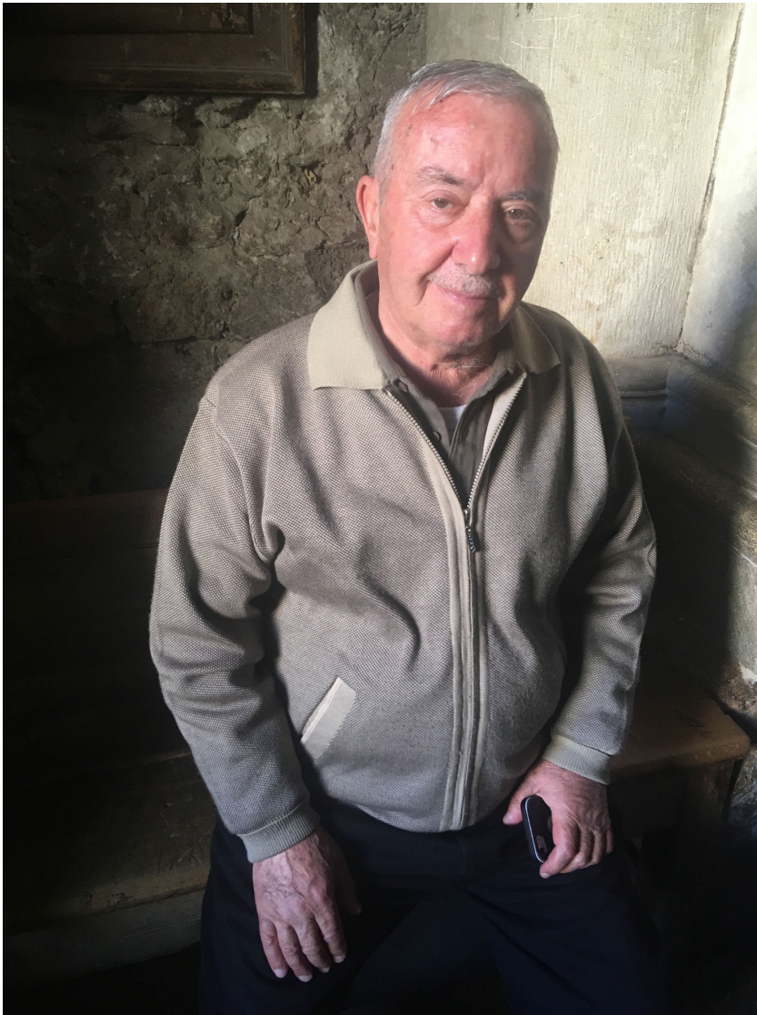
Keeper of the door, Church of the Holy Sepulcher, Old Jerusalem, Israel