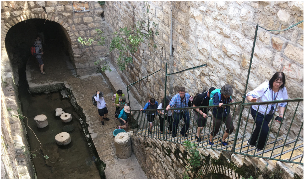
Tour group exiting Hezekiah's Tunnel, Old Jerusalem, Israel

I know we can discuss the doctrine and philosophy of baptism in scripture, until the second coming, but I'm going to wait until I hear it from Jesus.