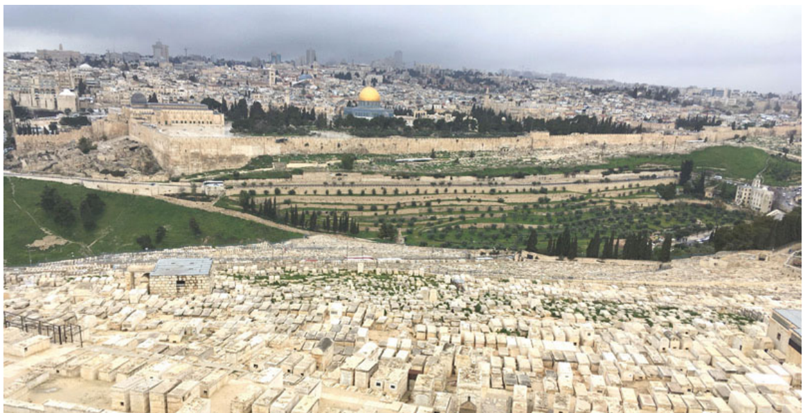
Jewish cemetery, eastside of The Temple Mount and Old Jerusalem, Israel

Even though I have always been a believer, there are many things I struggle with in the Bible that often test my faith...the idea of a supreme being for one. I know many of you have struggled as well. With the help of this book we will stroll together, ask questions of faith, and search for answers that will, hopefully, bless us for an eternity.