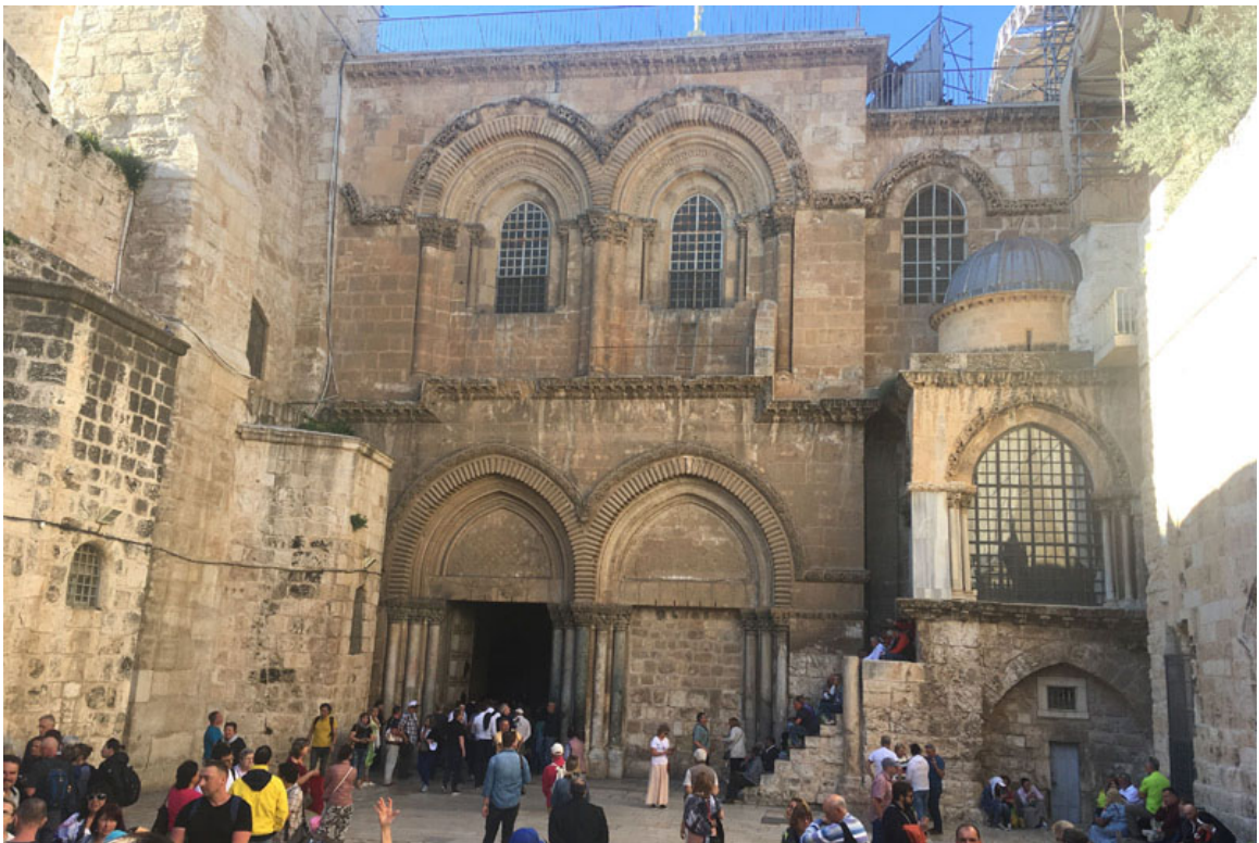
Church of The Holy Sepulcher, Old Jerusalem, Israel

This is the traditional site of the crucifixion, burial and resurrection of Jesus. It was built in 335 A.D., demolished in 1009 and rebuilt in 1048 A.D. It is one of the most holy sites in Christianity. There are six Christian denominations that share its ownership: Roman Catholic, Coptic Orthodox, Greek Orthodox, Syriac Orthodox, Armenian Apostolic and Ethiopian Orthodox.