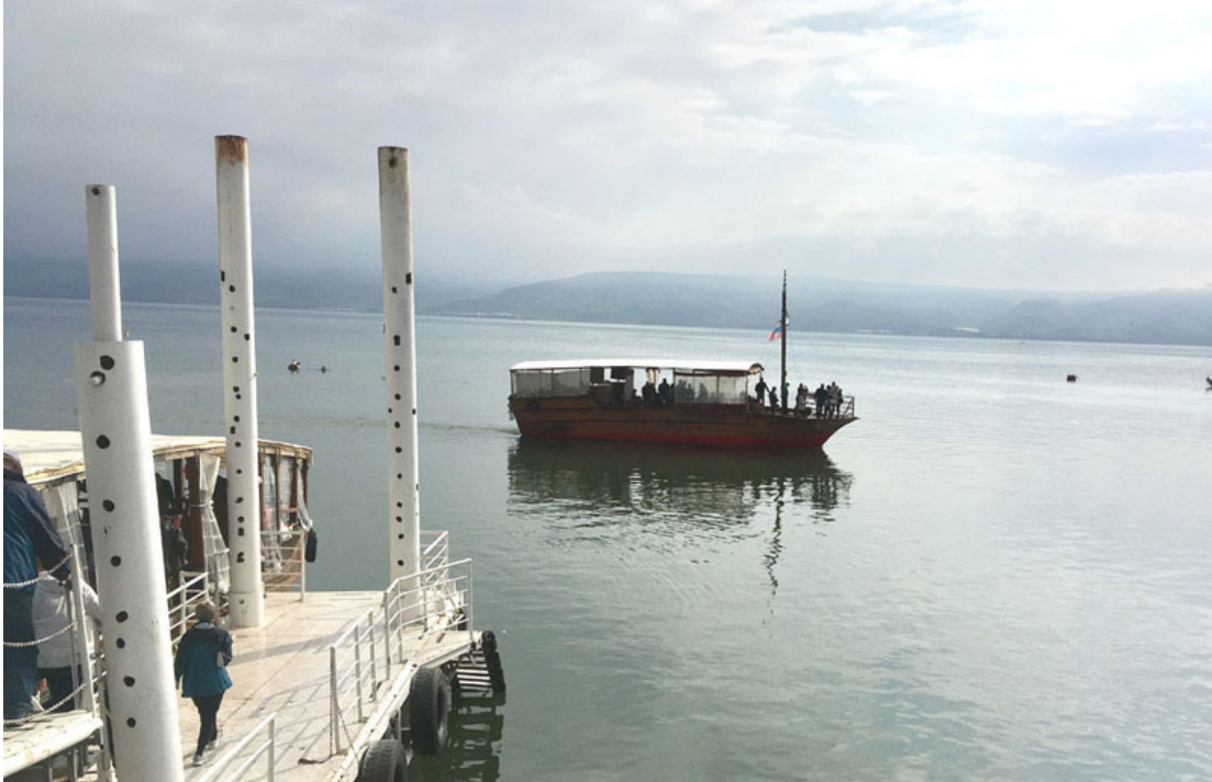
Tour boat, Sea of Galilee, Israel

As you know Jesus walked on water here, but did you know there are scriptures that prophesy that event?