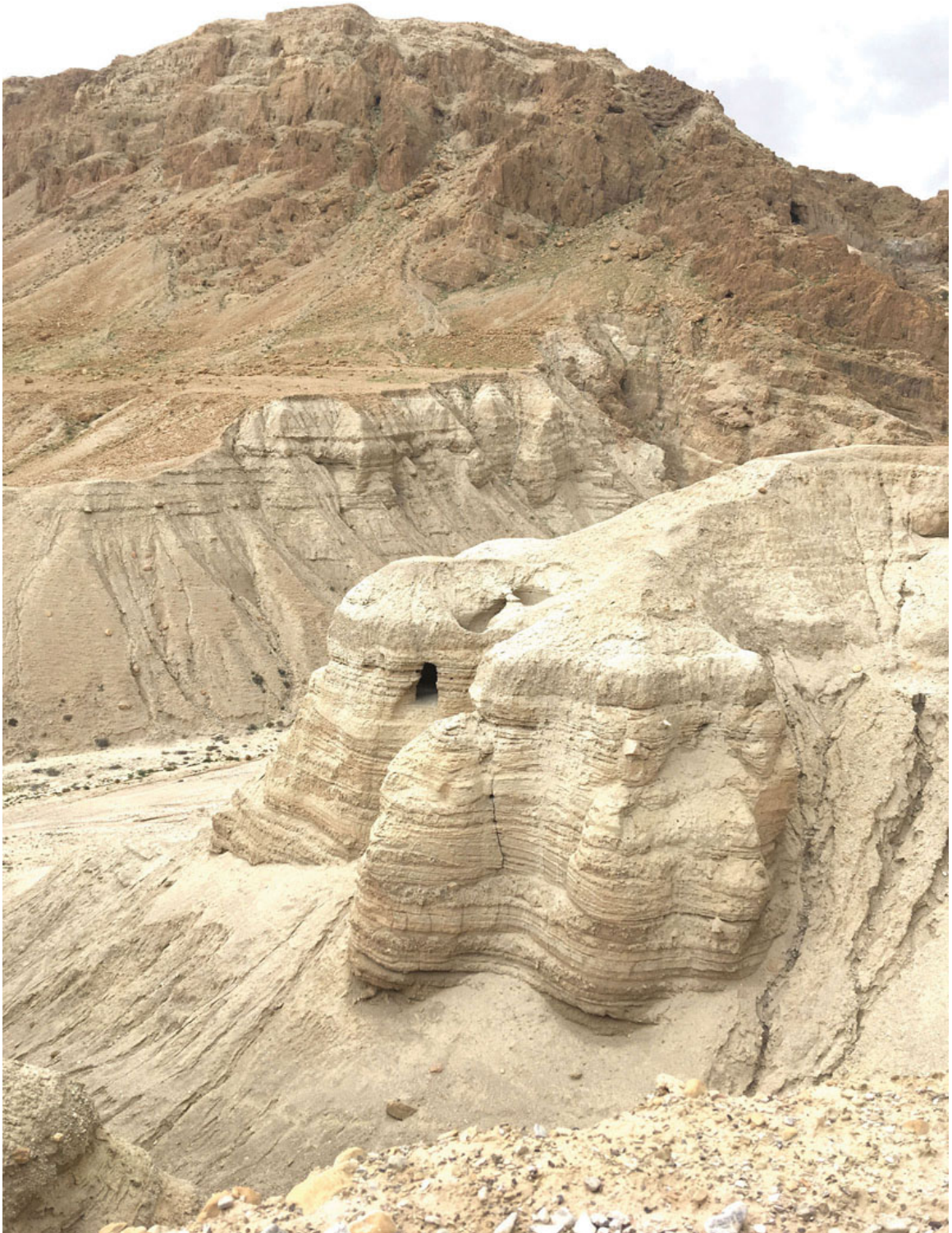
Ancient caves used by Jewish sect called Essenes to hide Dead Sea Scrolls, Southern District, Qumran, Israel