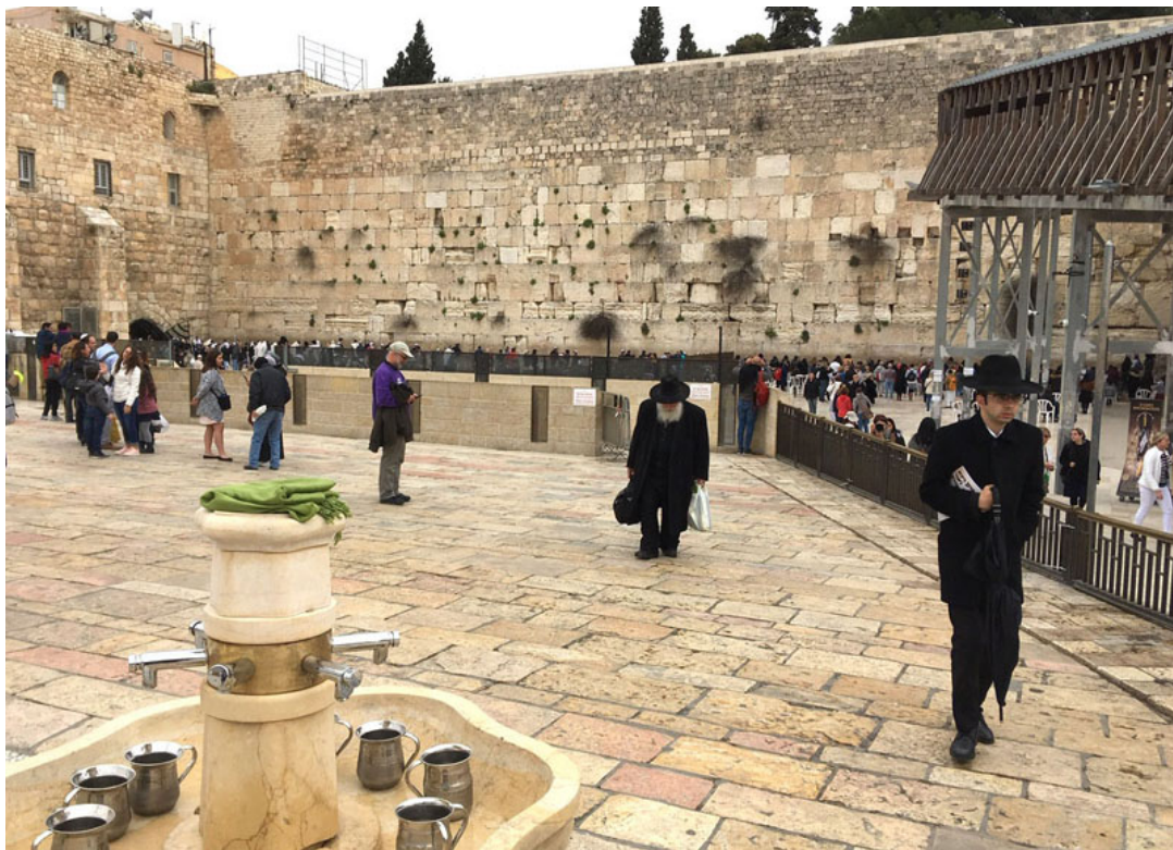
Praying at the Western Wall, Old Jerusalem, Israel

For hundreds of years Jews have prayed at the Western Wall and have placed prayer notes between its stones. Following the Six Day War, in 1967, Israelis regained control of all of Old Jerusalem and removed houses adjacent to the Western Wall making a large plaza capable of holding thousands of worshipers. They also began archaeological digs along and the Wall exposing lower levels and excavations have been going on ever since. (The Western Wall: History and Overview, Jewish Virtual Library)