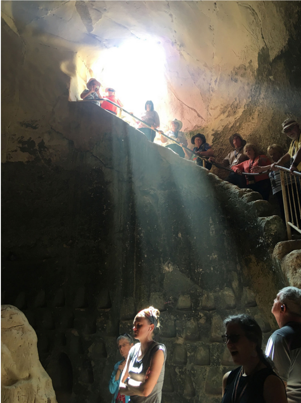
Columbarium Cave, used to store ash urns of the dead. Bet Guvrin, Israel

But God said to him, you fool, this night your soul shall be required of you: then whose shall those things be, which you have provided? So is he that laid up treasure for himself, and is not rich toward God. (Luke 12:16-21)